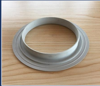
New JH Hard Collars

JH Termite Barrier is an environmentally friendly subterranean termite protection system for new buildings.